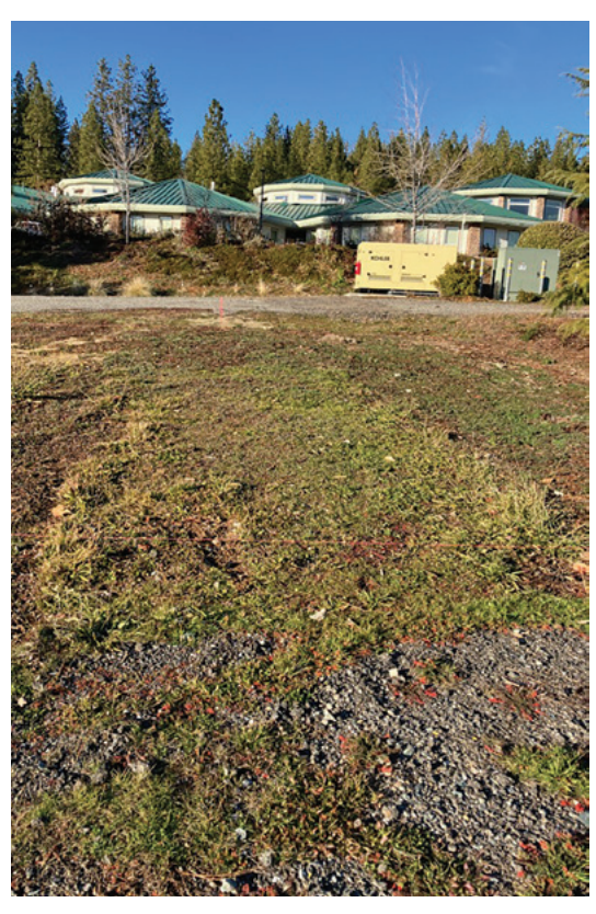
Future site of our Grass Valley Veggie Garden.

We have identified space to build a veggie garden in Grass Valley now that construction for our expansion is complete. The goal is to have the garden ready for planting this spring. The garden will offer healthy organic nutrition and opportunities to get outside, enjoy nature, and get exercise. We hope it will become a beautiful space enjoyed by patients, visitors, and staff. We will keep you updated as our project progresses!