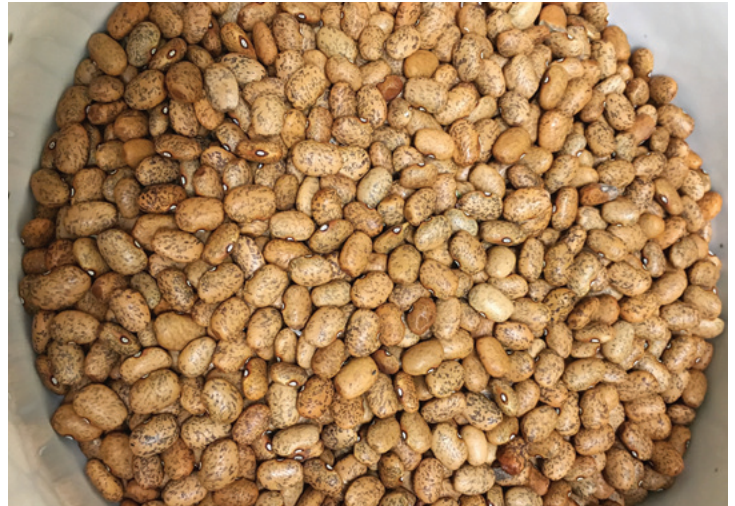
Brown speckled tepary beans grown in the Chapa-De garden.