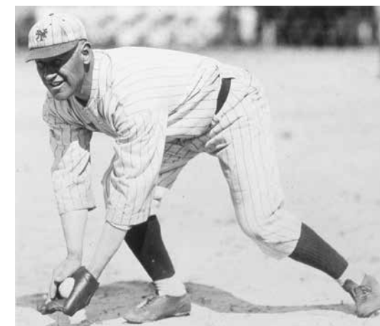
Jim Thorpe fields a ground ball for the New York Giants, year unknown.