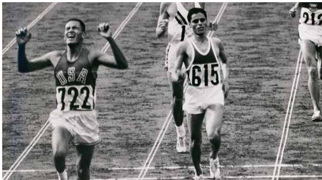
Billy Mills breaks the tape in the 10,000-meter run to take gold in the 1964 Olympics.

While serving in the U.S. Marine Corps, he returned to racing in 1964, qualifying for that year's Olympic Games in Tokyo. Mills was a little-known entrant in the 10,000-metre run; among those favored to win was Ron Clarke, of Australia, who held the world record. On a wet track, Mills kept pace with the leaders until the final lap, when Clarke and