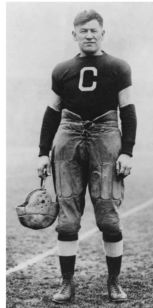
Jim Thorpe in his Canton Bulldogs football jersey circa 1915.